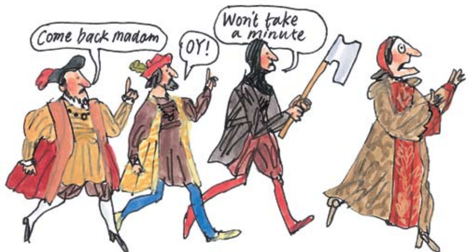
Margaret Pole - refusing to go quietly.

Tudor London's usual execution sites were to the west of the city. Tower Hill, next to the Tower of London, was occasionally used for the execution of some of the fortress's prisoners. The Tower of London itself though was not generally a place of execution.