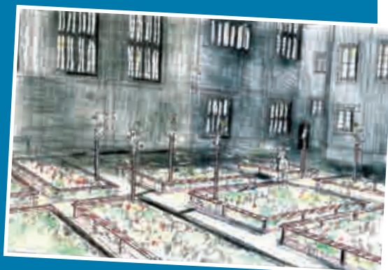
Artist's impression of the completed Chapel Court Garden

The design will include the defining features of the Tudor Court garden: beds of flowers, herbs and topiary; and decorated rails. We are also commissioning eight carved, painted and gilded wooden 'Kings beestes' - a bull, dragon, falcon, leopard, greyhound, lion, white hind and a yale.