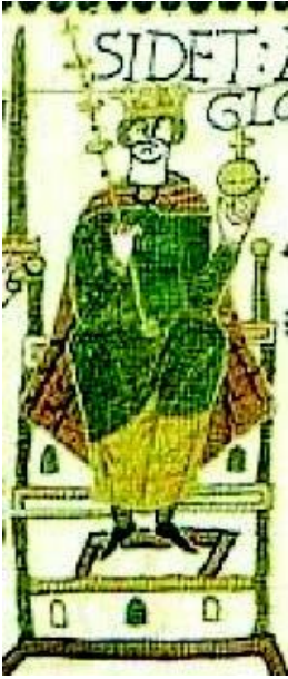
Harold Godwinson (c. 1022-1066) Reigned 1066

Harold II (or Harold Godwinson) was the last Anglo-Saxon king of England.