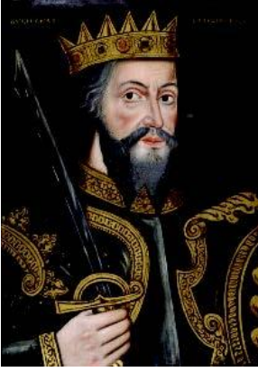
Duke William I of Normandy (William I of England)