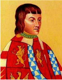
Anthony Woodville, Earl Rivers Born around 1440, died 1483

Earl Rivers was Elizabeth Woodville's brother. At the time of Edward IV's death he was in Wales with young Edward and immediately set off to bring the new king to London.