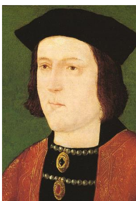
Edward IV 1442 - 1483 King (1st time): 1461-70 (2nd time): 1471-83

Edward IV was born in troubled times during the Wars of the Roses, in which his family (the Yorkists) fought the Lancastrian family for control of England. He spent his early reign as king fighting battles across the country.