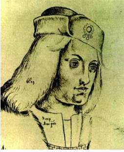
Perkin Warbeck Born around 1474, died 1499

The problem with the disappearance of the Princes in the Tower, was that no one ever saw the boys' dead bodies, and rumours went about that they were still alive.