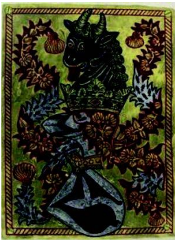
William Hastings, Baron (or Lord) Hastings Born around 1431, died 1483

Rivers was accused of treason, sent to prison in Pontefract in Yorkshire, and executed.