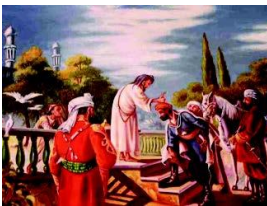
Ahmad Abdali 1722 - 1772

Nadir Shah was later assassinated by his own troops and the diamond passed to one of his Afghan commanders Ahmed Khan Abdali.