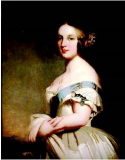
Queen Victoria 1819 - 1901

Queen Victoria was the longest reigning British monarch and the figurehead of a vast Empire.