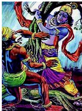
Krishna and Jambavan

According to some Hindu legends, the Koh-i-Nûr diamond was found over 5000 years ago and given to Krishna by Jambavan, King of the Bears.