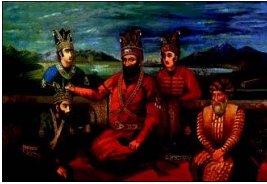
Nadir Shah 1688 - 1747

After recapturing the lost Persian territories from the hands of the Russians and restoring the Persian Empire, general Nadir Shah set his sights on the Indian subcontinent.