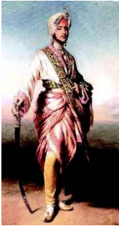
Maharaja Ranjit Singh 1780 – 1839 Duleep Singh 1838 – 1893

Maharajah Ranjit Singh allegedly seized the Koh-i-Nûr from Shah Shuja, an exiled Afghan King, in return for his sanctuary.