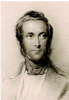
Lord Dalhousie, Governor General of India 1812 – 1860

Duleep died in Paris in 1893 after suffering for many years from mental and physical illness.