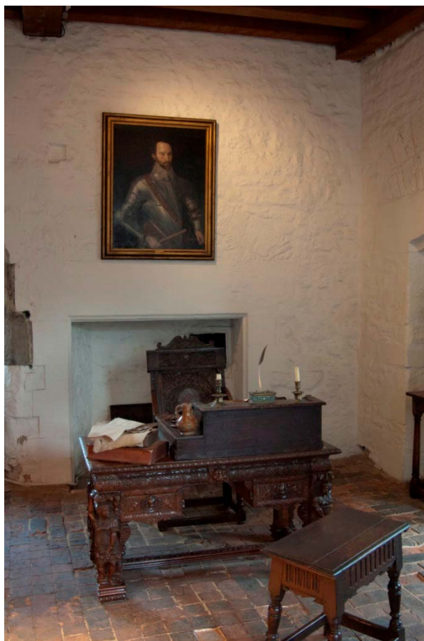
Sir Walter Raleigh's room at the Tower

There are no cells or dungeons at the Tower! Important prisoners were kept at the Tower because it was safe and secure.