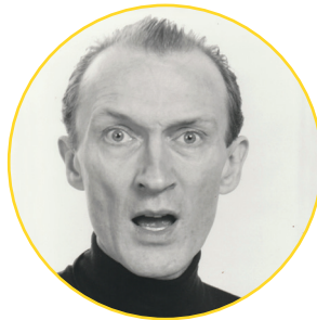
LAVINIA CO-OP King George II

TV includes: The Capture (BBC) Get Even (CBBC) Cursed (Netflix) and I hate Suzy (Sky).