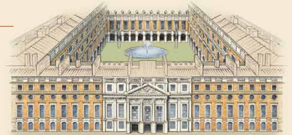
The East Front, William & Mary 1689