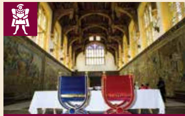
Henry VIII's Apartments