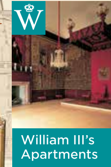
William III's Apartments