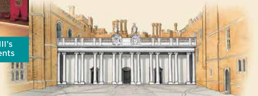
The Colonnade, Clock Court