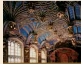
Chapel Royal via Henry VIII's Apartments