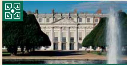
The East Front & Gardens