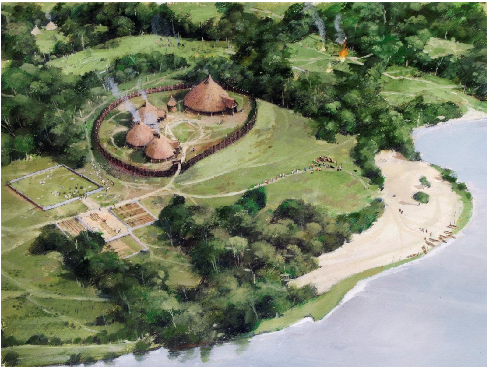
An artist's impression of the pre-Roman settlement on what would later become the site of the White Tower, AD 40