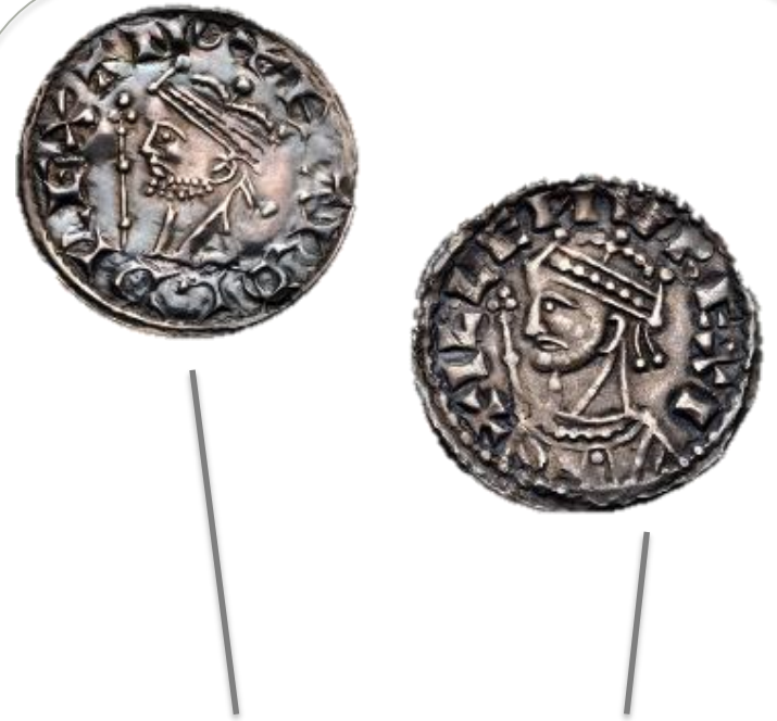
Pennies of Harold II (1066) and William I (1068)

The four pairs of small windows (circled) are the only remaining windows in the original Norman style. The wooden staircase has been rebuilt, but it reflects the original Norman design.