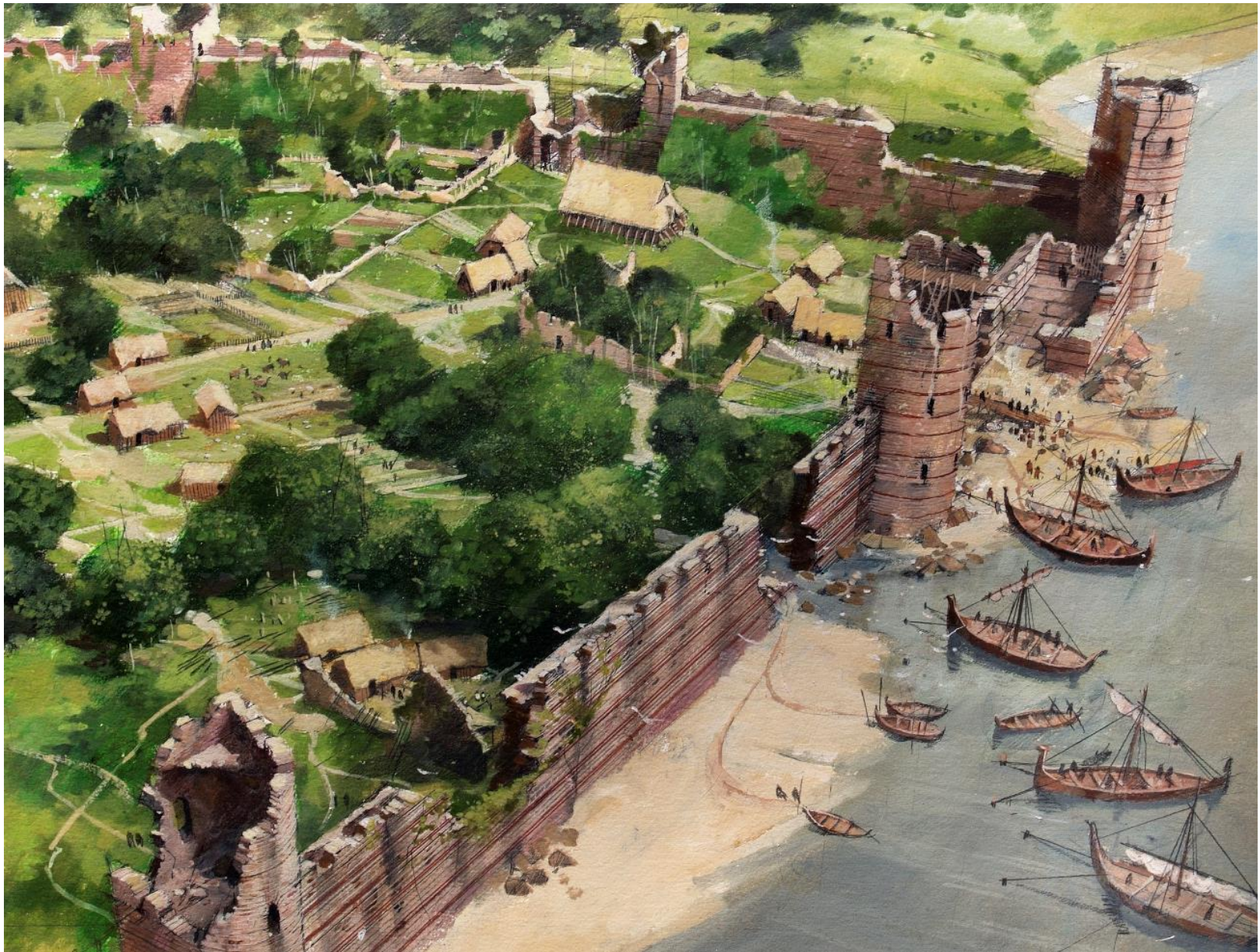
An artist's impression of the Roman city walls being repaired in the aftermath of Viking invasions, AD 886