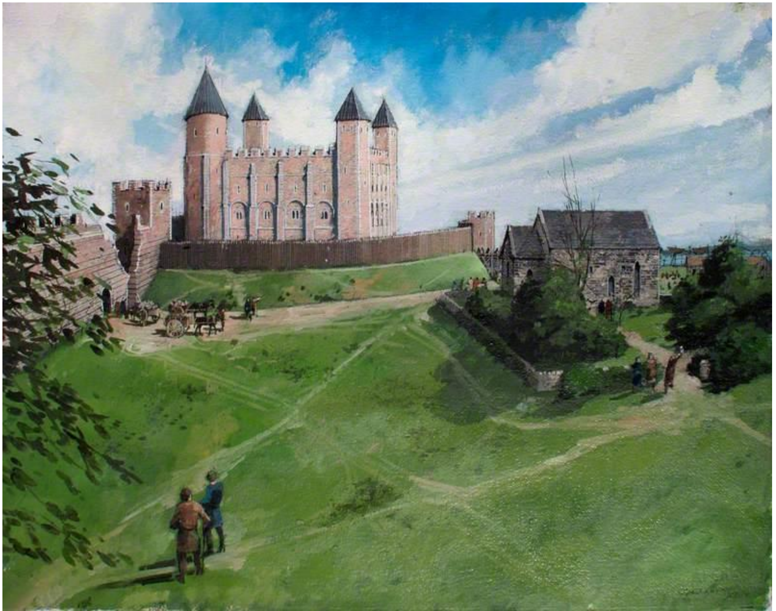
An artist's impression of the completed White Tower, AD 1100