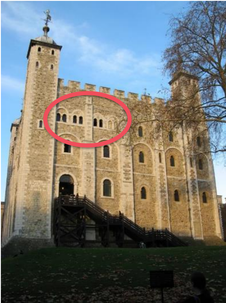
The White Tower today, viewed from the South Lawn

The four pairs of small windows (circled) are the only remaining windows in the original Norman style. The wooden staircase has been rebuilt, but it reflects the original Norman design.