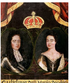
GUIIIIIIIIS REX MATIA ROLL