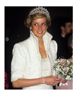
Diana, Princess of Wales