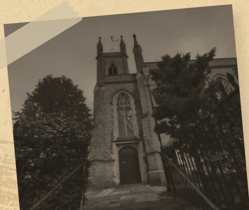
THE CHURCH STRUCK BY LIGHTNING