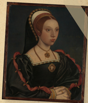
↑ CATHERINE HOWARD