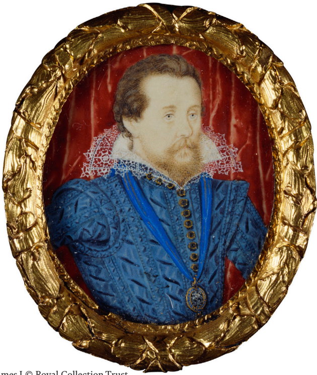
James I © Royal Collection Trust