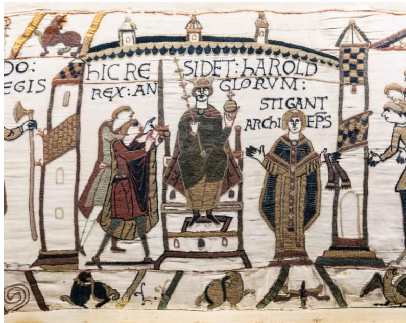
King Harold, Bayeux Tapestry 6 th January 1066