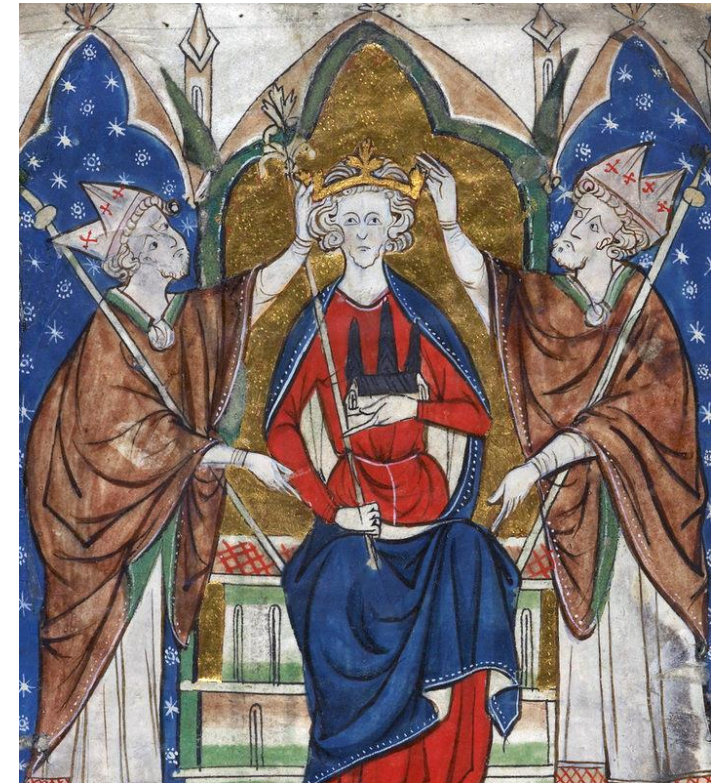
Henry III 28 th October 1216